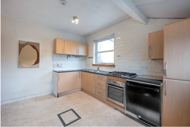
This image has been virtually staged for marketing purposes only.