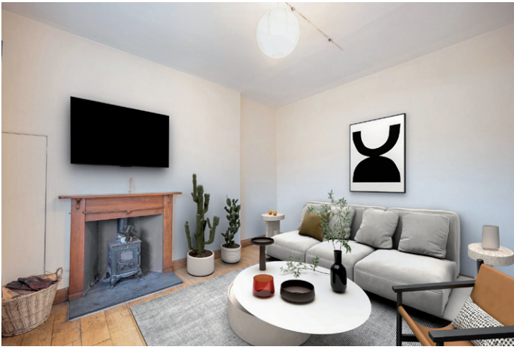
This image has been virtually staged for marketing purposes only.