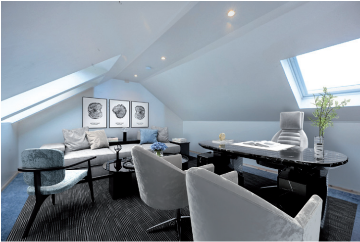
This image has been virtually staged for marketing purposes only.