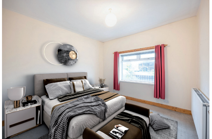
This image has been virtually staged for marketing purposes only.