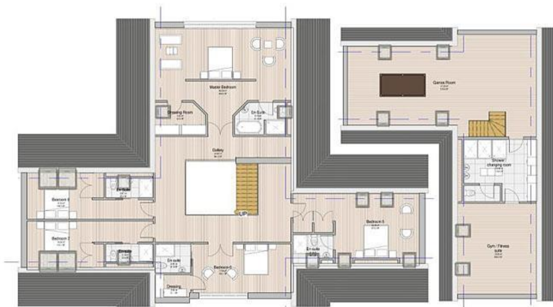
1st Floor Plan - Indicative only