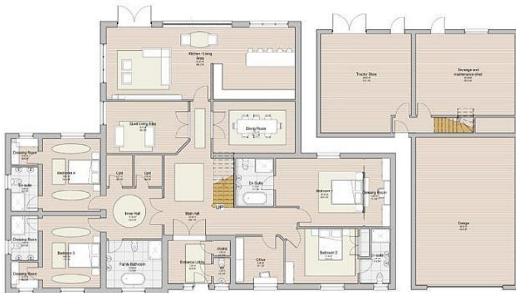
Ground Floor Plan - Indicative only