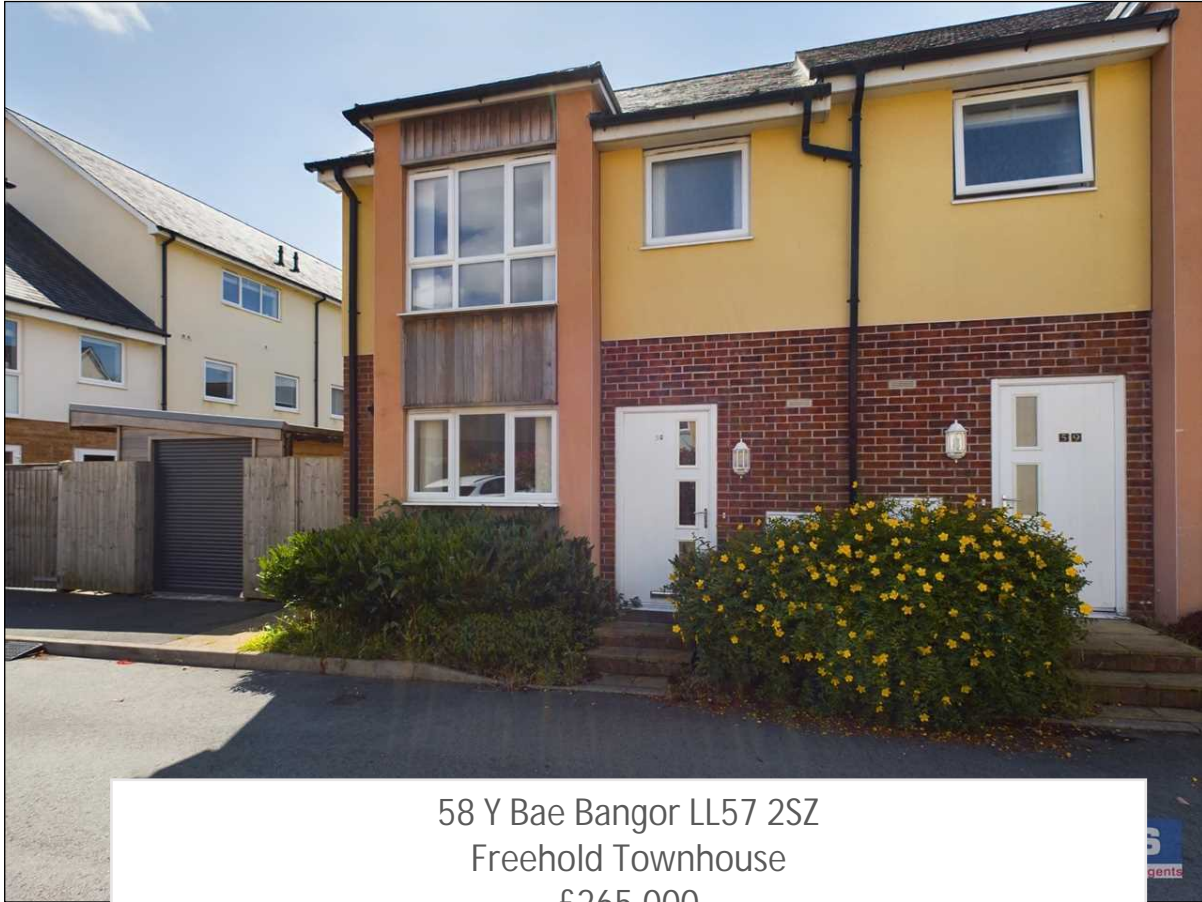
58 Y Bae Bangor LL57 2SZ Freehold Townhouse £265,000