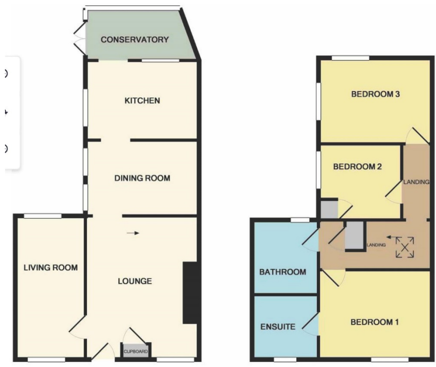
GROUND FLOOR APPROX. FLOOR AREA 538 SQ.FT. (50.0 SQ.M.)