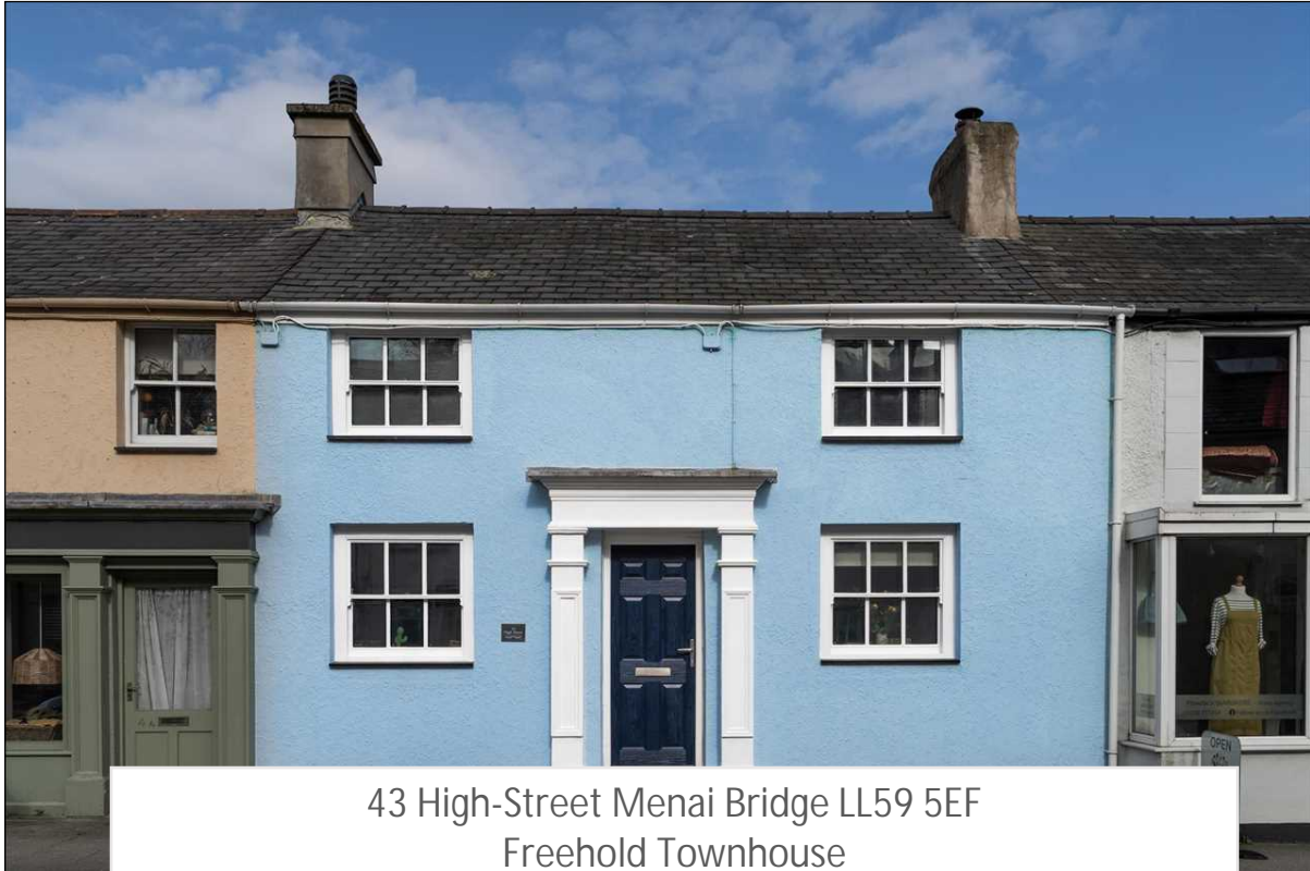
43 High-Street Menai Bridge LL59 5EF Freehold Townhouse £340,000