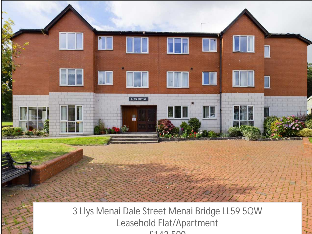
3 Llys Menai Dale Street Menai Bridge LL59 5QW Leasehold Flat/Apartment £142,500