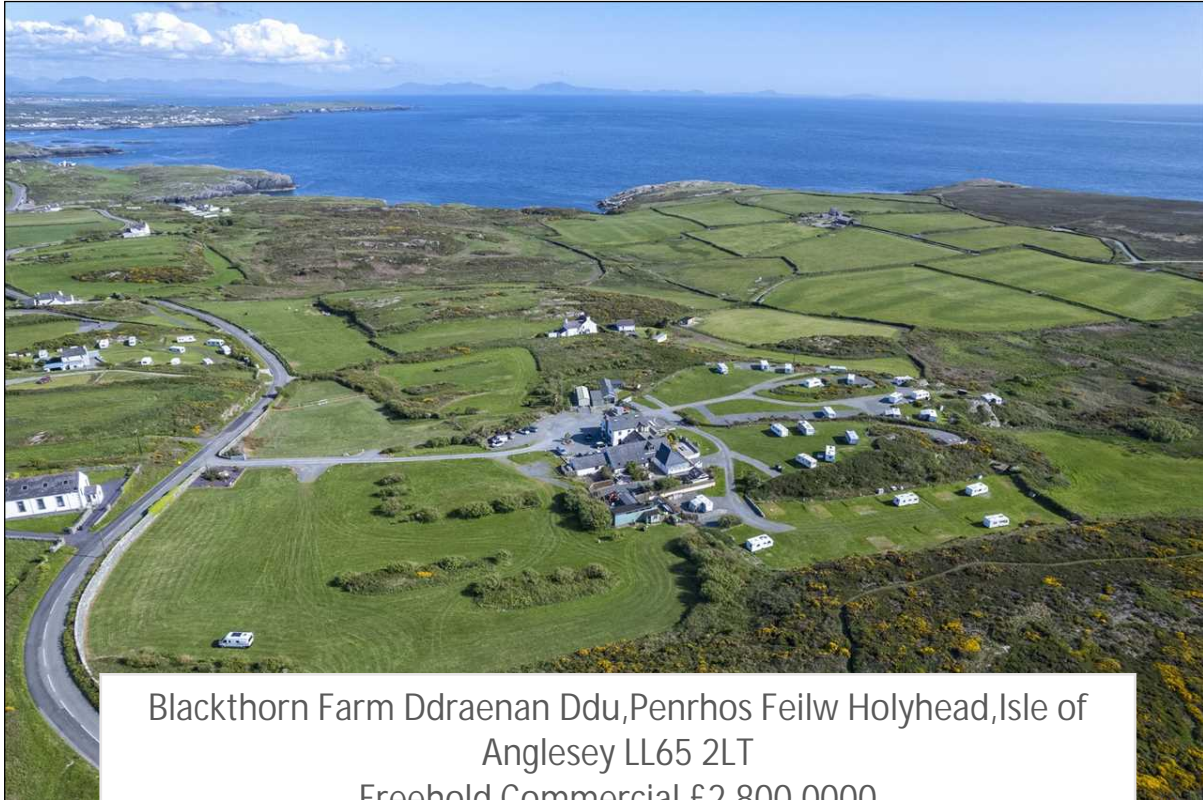
Blackthorn Farm Ddraenan Ddu, Penrhos Feilw Holyhead, Isle of Anglesey LL65 2LT Freehold Commercial £2,800,0000