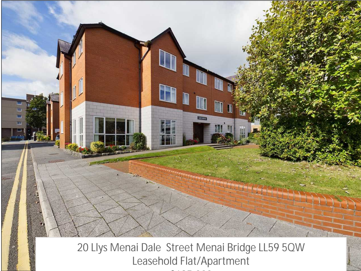
20 Llys Menai Dale Street Menai Bridge LL59 5QW Leasehold Flat/Apartment £135,000