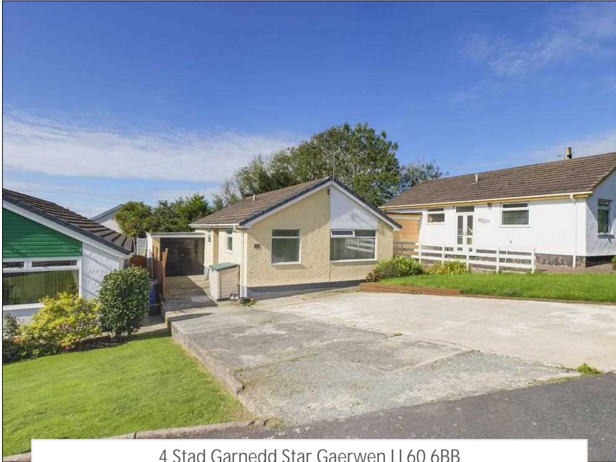
4 Stad Garnedd Star Gaerwen LL60 6BB Freehold Detached Bungalow £195,000