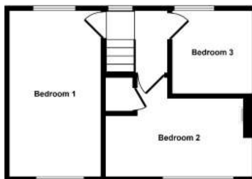
First Floor Approx 33 sq m / 356 sq ft

This floorplan is only for illustrative purposes and is not to scale. Measurements of rooms, doors, windows, and any items are approximate and no responsibility is taken for any error, omission or mis-statement. Icons of items such as bathroom suites are representations only and may not look like the real items. Made with Made Snappy 360.