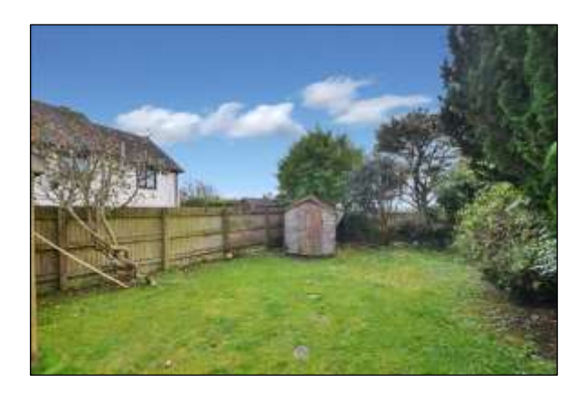
SERVICES Mains electricity, gas and drainage.