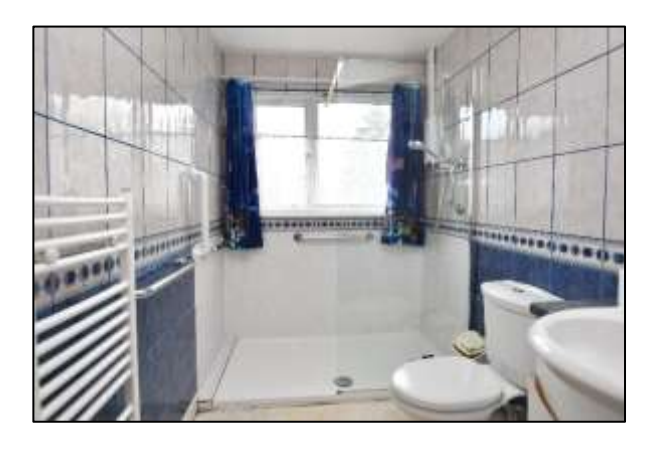
BEDROOM ONE 3.30m (10'10") x 3.33m (10'11") (plus door recess)

With wooden flooring and built-in wardrobes, UPVC double glazed windows, central ceiling pendant light, radiator.