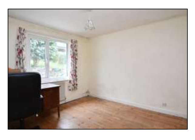
BEDROOM THREE 2.67m (8'9") x 2.57m (8'5")

UPVC double glazed window overlooking the rear garden with wooden flooring, central ceiling, pendant light and radiator.