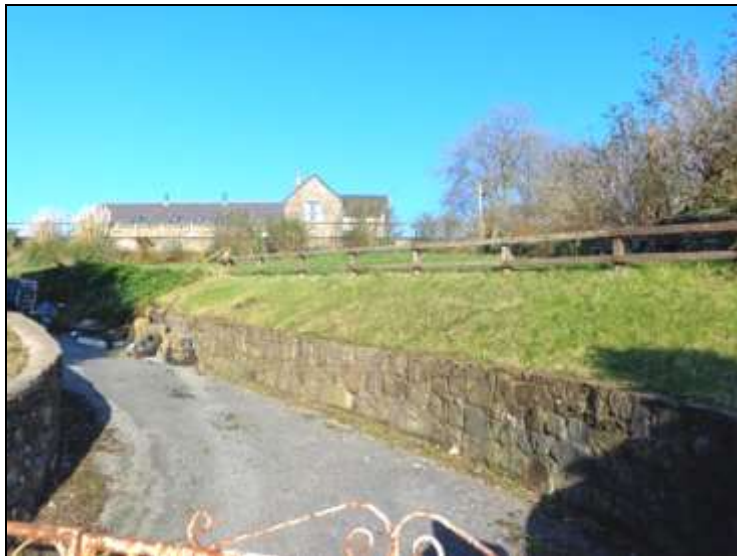
FROM ROAD BELOW