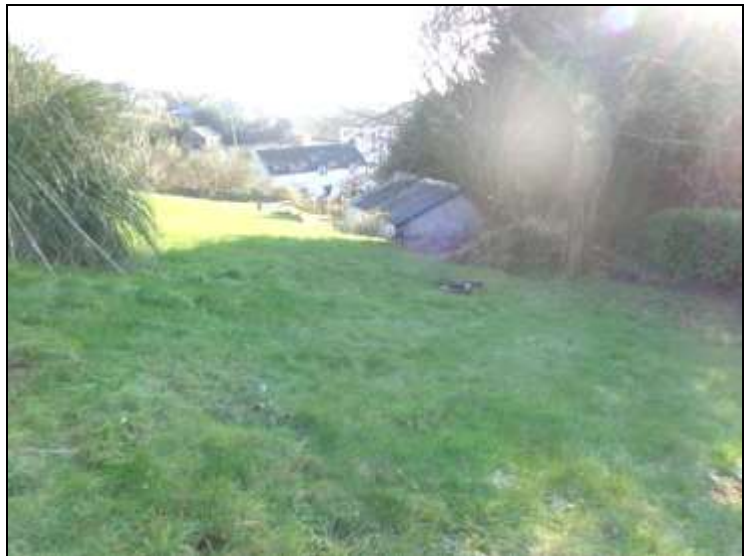
FROM FORMER SCHOOL ABOVE