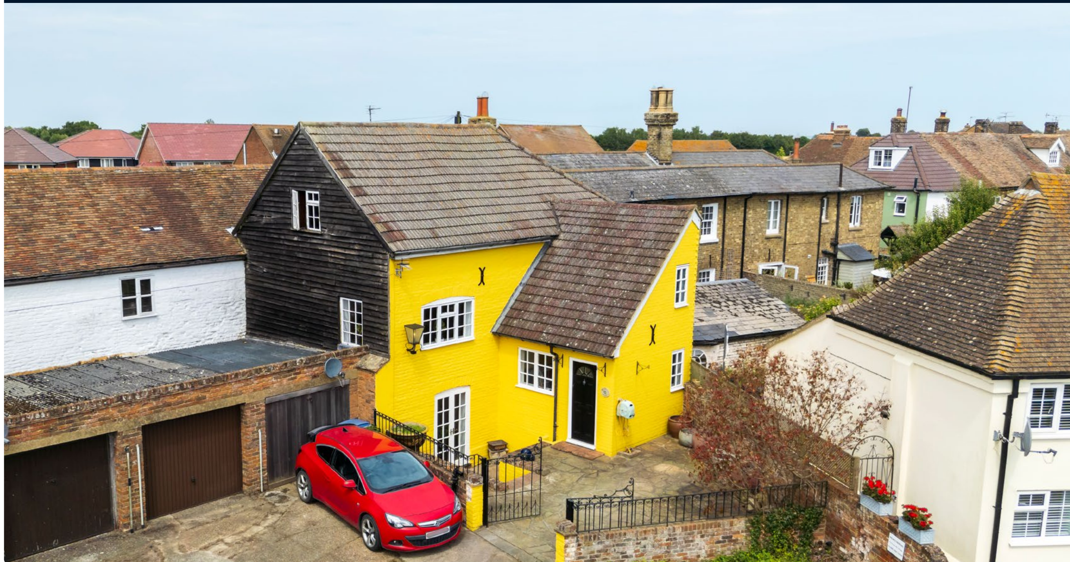
Brewery House, New Street, Ash CT3 2BH