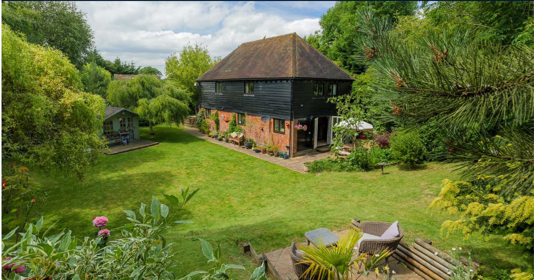
Old Coach House, Bicknor Lane, Bicknor ME9 8AY