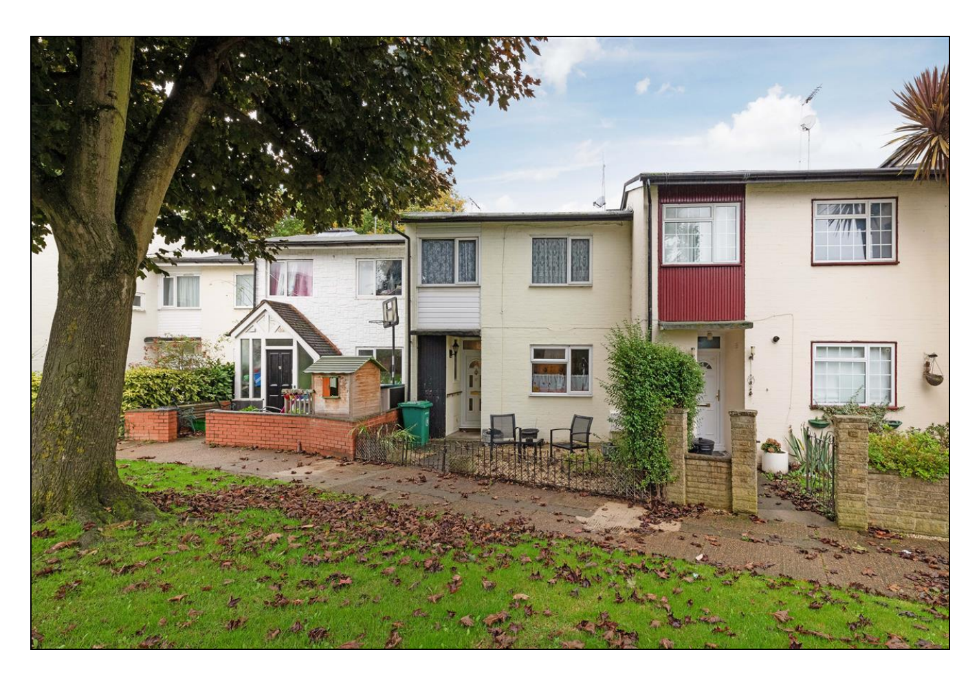
Horndean Close, Roehampton £450,000