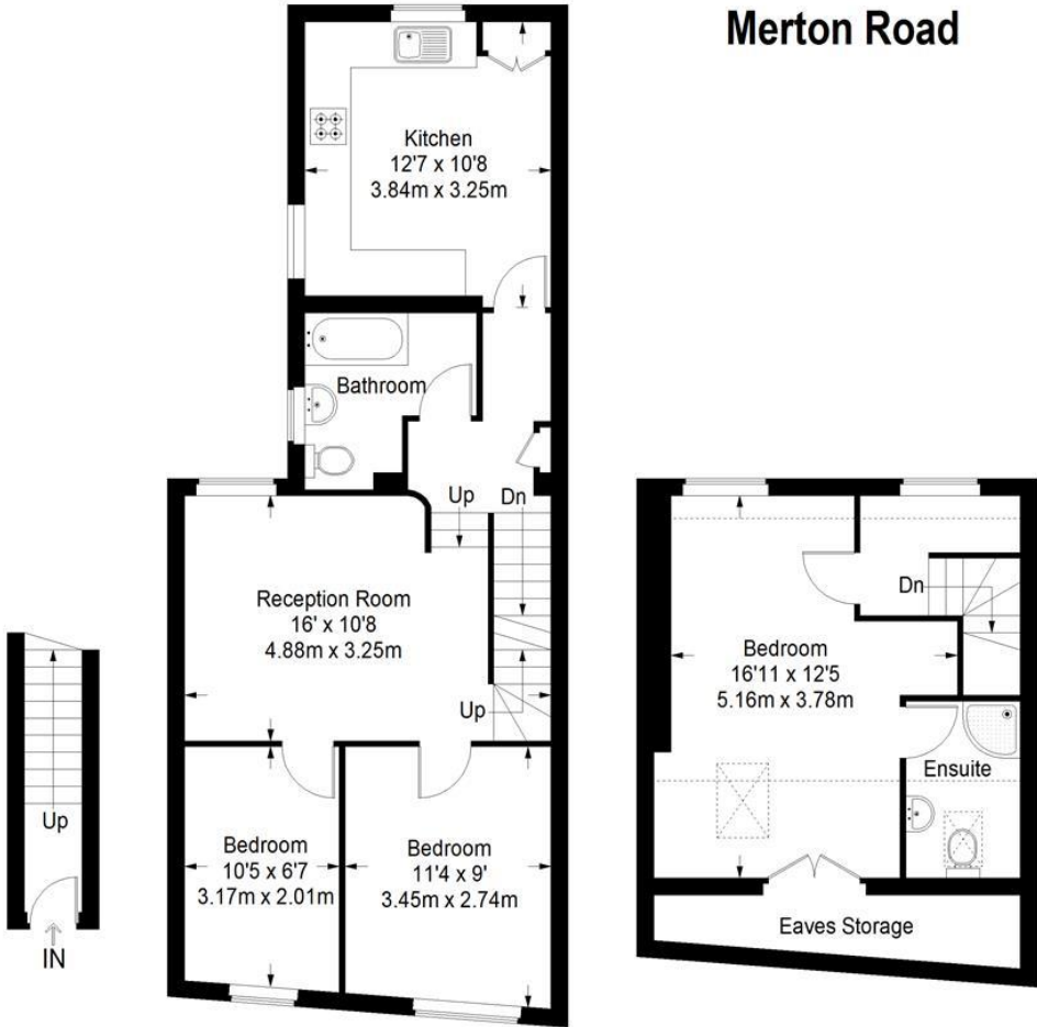
Ground Floor Entrance = 31 sq ft