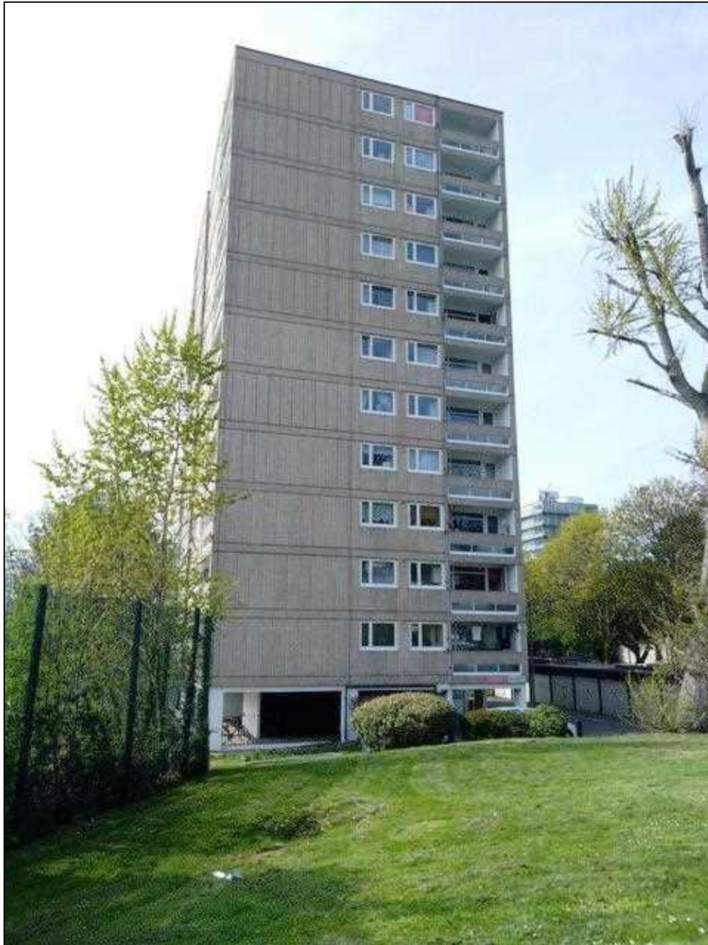
Lyndhurst House, Roehampton