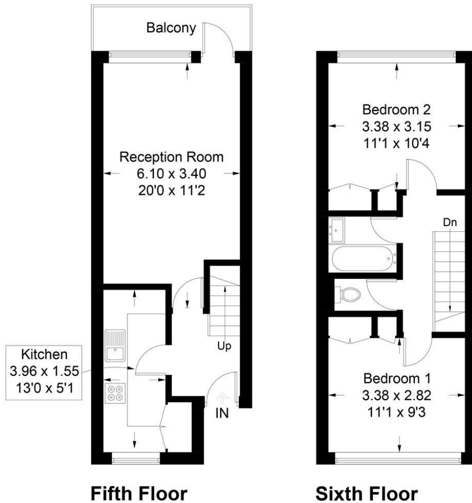
Illustration for identification purposes only, measurements are approximate, not to scale. FloorplansUsketch.com © 2018 (ID43002)

149 Arthur Road, Wimbledon Park, SW19 8AB 168 Putney High Street, Putney, SW15 1RS 120 Wimbledon Hill Road, Wimbledon, SW19 7QU