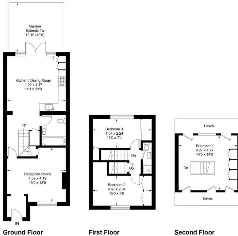
Illustration for identification purposes only, measurements are approximate, not to scale. FloorplansUsketch.com © 2017 (ID392336)

Approximate Gross Internal Area = 105.7 sq m / 1138 sq ft