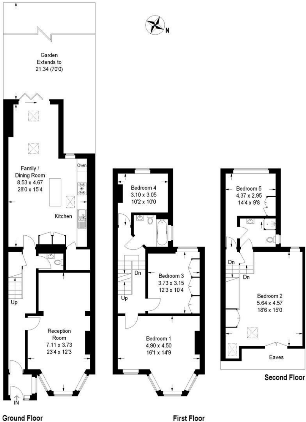
Illustration for identification purposes only, measurements are approximate, not to scale. FloorplansUsketch.com © 2017 (ID321832)

Approximate Gross Internal Area (Excluding Eaves) 168.0 sq m / 1808 sq ft