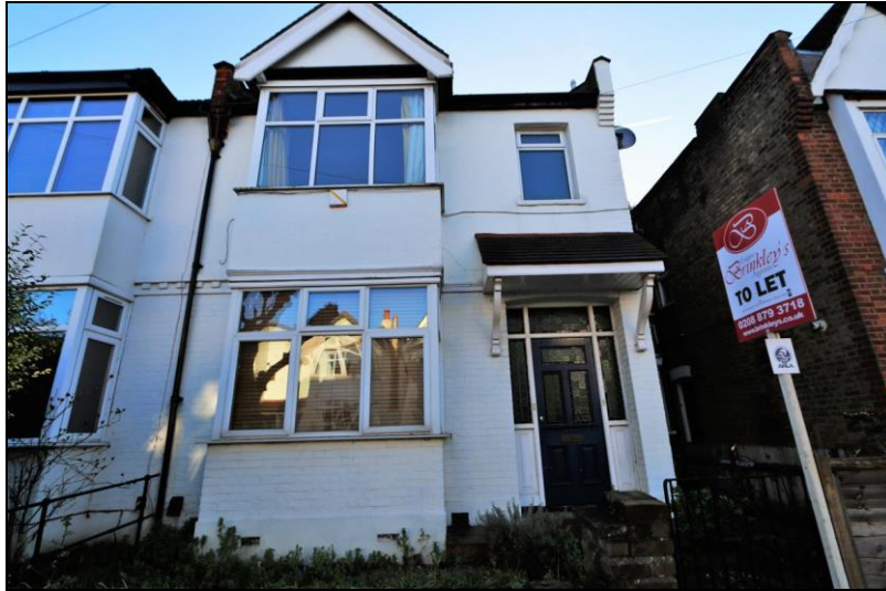
18 Southdown Road, Wimbledon, Wimbledon £1,350