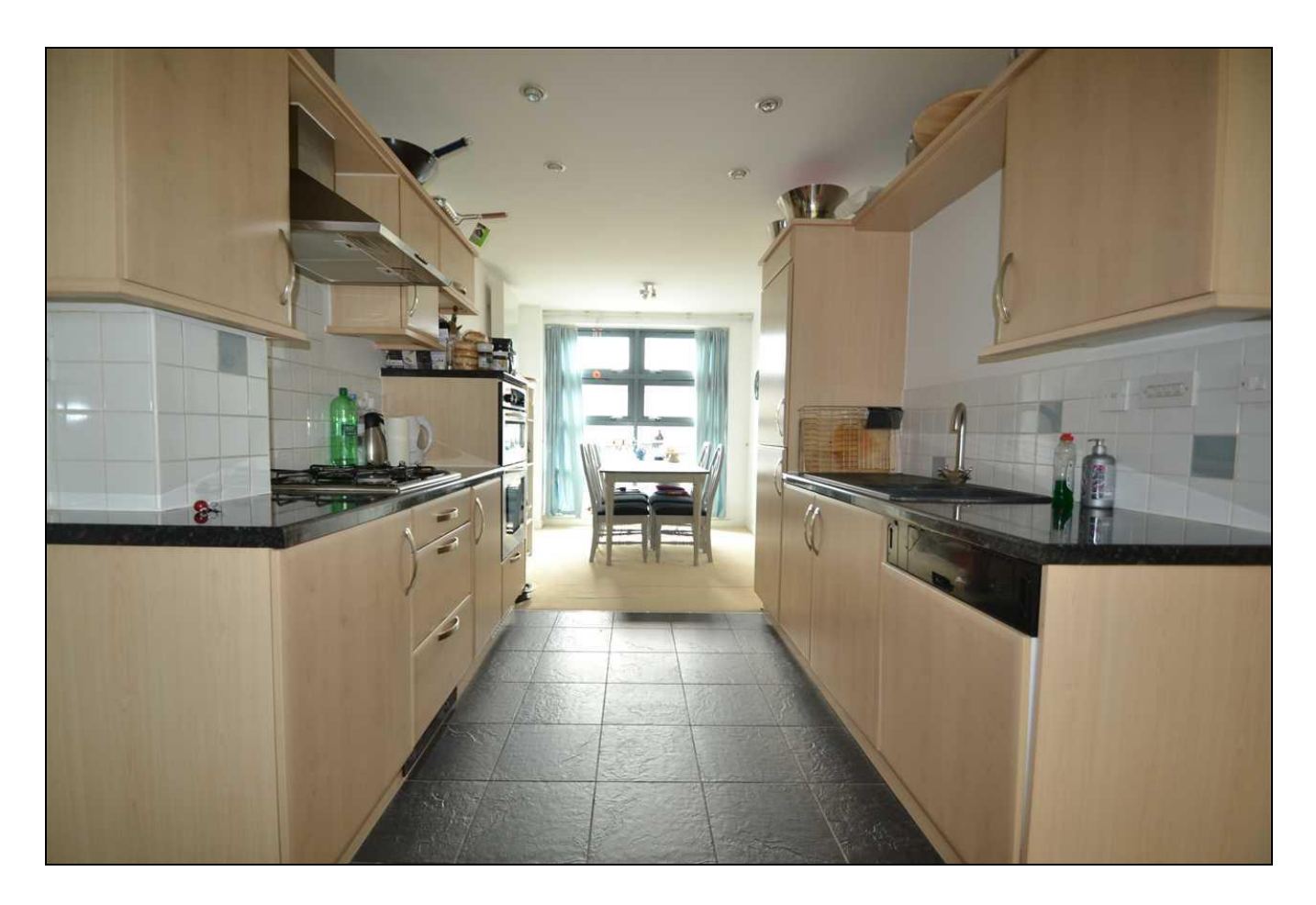
Pallister Terrace, Putney Vale £1,650 pcm