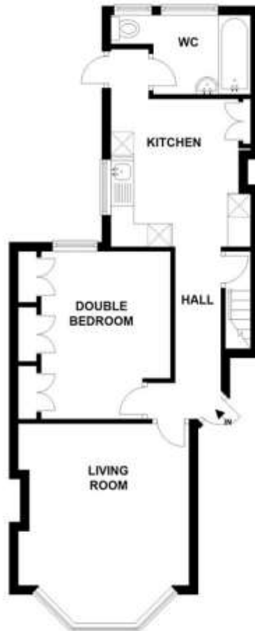
FLOOR PLAN APPROX. 46.5 SQ. METRES (500.5 SQ. FEET)