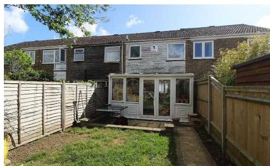
29 Clockhouse, Ashford, TN23

Key Features GUIDE PRICE £180,000 - £190,000 TWO BEDROOM TERRACED HOME OPEN PLAN LIVING AREA MODERN BATHROOM CONSERVATORY CLOSE TO SHOPS & AMENITIES IDEAL FIRST TIME BUY OR INVESTMENT PROPERTY NO ONWARD CHAIN