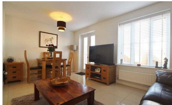
Southdown Close, Kingsnorth, TN25

Key Features GUIDE PRICE: £260,000- £275,000 3 BEDROOM SEMI-DETACHED HOME BEAUTIFULLY PRESENTED THROUGHOUT IMPRESSIVE LOUNGE/DINER MASTER BEDROOM WITH EN-SUITE DOWNSTAIRS CLOAKROOM GARAGE AND OFF ROAD PARKING POPULAR LOCATION NHBC WARRANTY