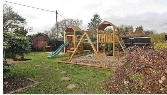
Finn Farm Road, Kingsnorth, TN25