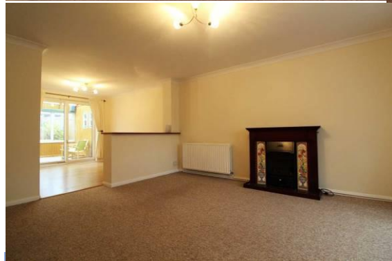
Hawks Way, Ashford, Kent, TN23 5UN