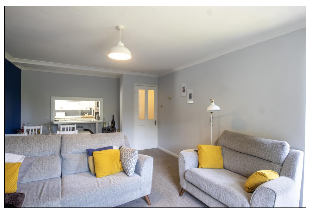
Windermere Court, Park Road

www.bond-sherwill.com sales@bond-sherwill.com