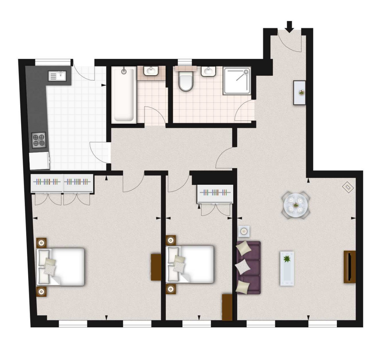
ILLUSTRATION FOR IDENTIFICATION PURPOSES ONLY. NOT TO SCALE * As Defined by RICS - Code of Measuring Practice

APPROX. GROSS INTERNAL AREA ^{\star} 860 Ft ^{2} - 79.89 M ^{2}